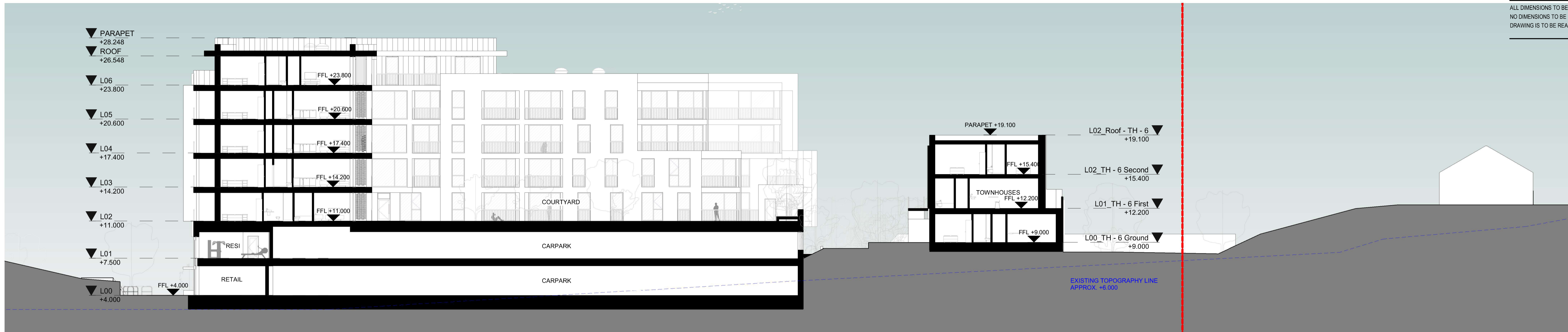
1 SECTION BB 1 : 200

ALL DIMENSIONS TO BE CHECKED ON SITE NO DIMENSIONS TO BE SCALED FROM THIS DRAWING DRAWING IS TO BE READ IN CONJUNCTION WITH RELEVANT CONSULTANTS DRAWINGS